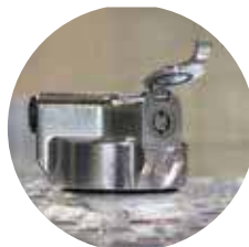
Lockable Security Cap