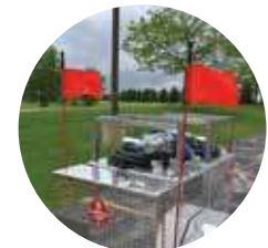
Marker Flags with LED Lights