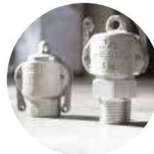
Quick Disconnect Fuel Hose Kit